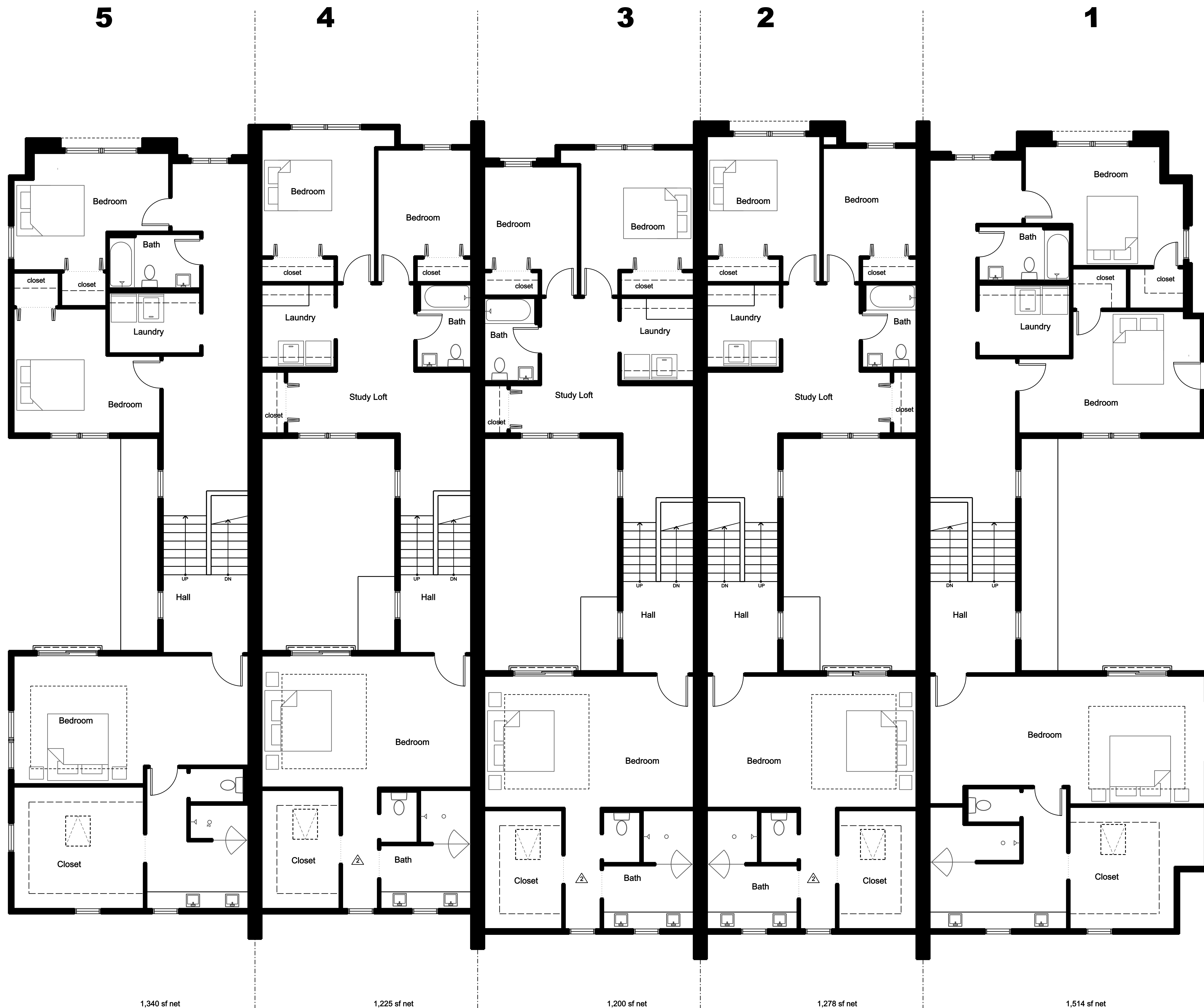
Second Floor Plan 1/4" = 1'-0"

Job Number: 20065.fbr3 Date: 19 August 2025