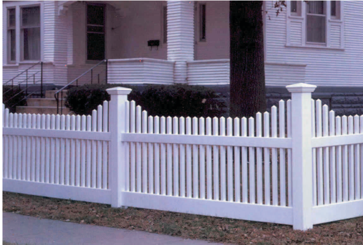
Vinyl fencing is the only acceptable material on NU-Lots

Required. All vinyl fences on the NU-Lots shall be white.