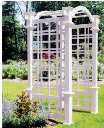
Examples of white vinyl arbors and gates acceptable for NU-Lots.