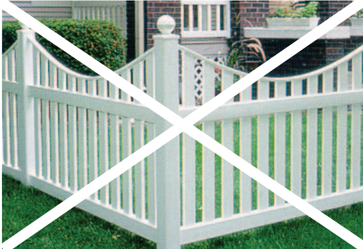
The closed scallop picket style fence—NOT ACCEPTABLE

The gothic, ball, pyramid, and molded decorative cap are allowed on fences occupying a NU-Lot.