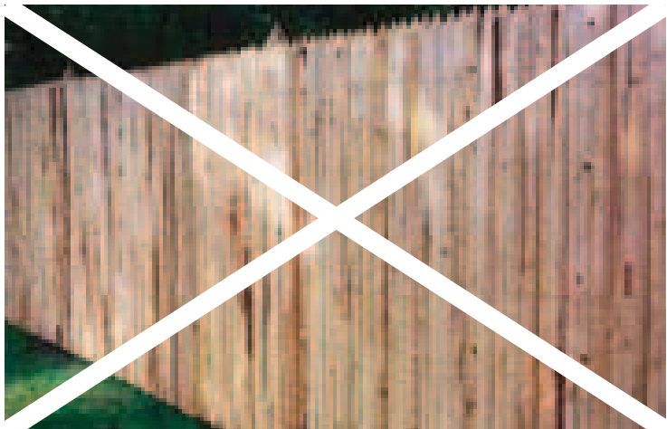
Stockade fencing—NOT ACCEPTABLE