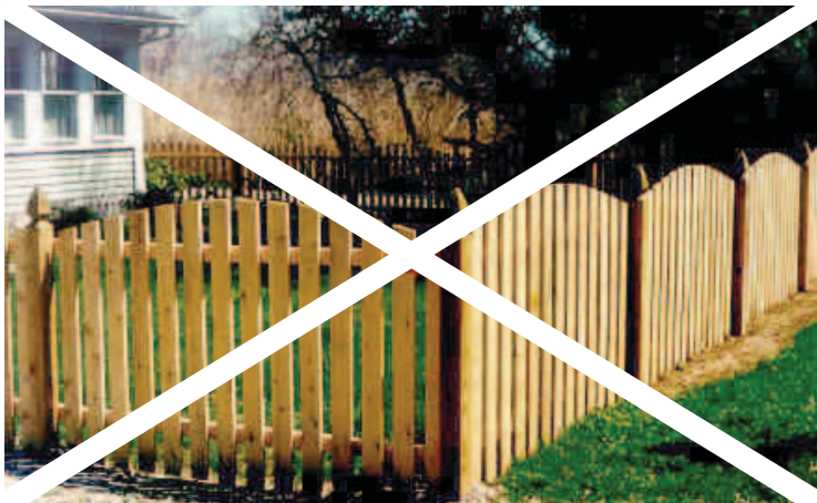
Wood fencing or colored vinyl fencing—NOT ACCEPTABLE on NU-Lots