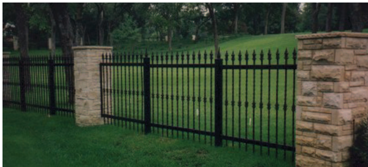
Ornamental iron fence with masonry columns encouraged on P-Lots