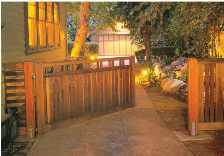
4' side yard wood fence and gate

Three (3) to four (4) foot fences are encouraged.