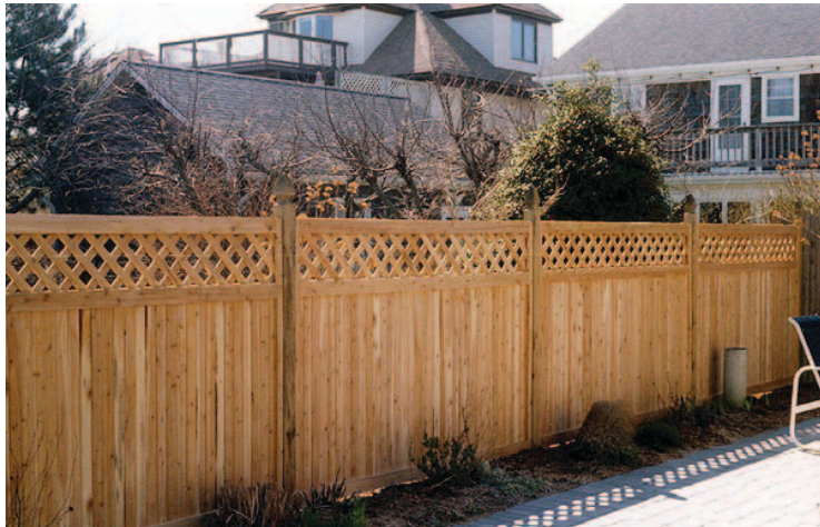
Acceptable solid opaque fence up to 4'-0" high with lattice above.

Required. Fences shall not be fully opaque solid. Fences may be opaque solid up to four (4) feet in combination with picket or lattice designs.