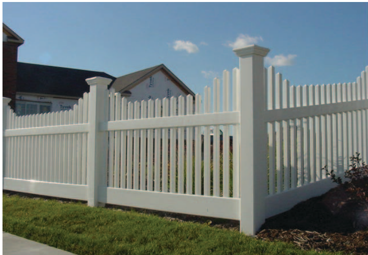
4'-0" vinyl fence with 1-3/8" stepped pickets