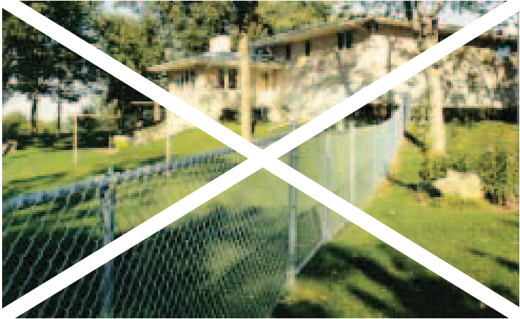
Chain-link fencing—NOT ACCEPTABLE

Stockade and chain-link style fencing are strictly prohibited on S- and P-Lots. Chain-link fence may be used for kennels only and must be either green or black in color.