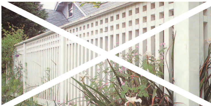
Painted wood fence—NOT ACCEPTABLE