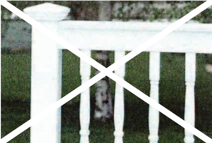
The spindle picket style fence—NOT ACCEPTABLE