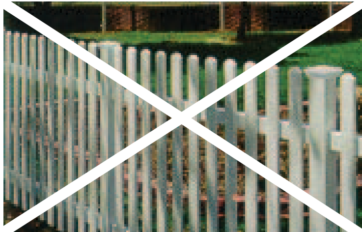
3" wide pickets—NOT ACCEPTABLE