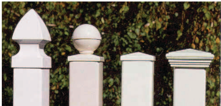
Examples of acceptable cap styles