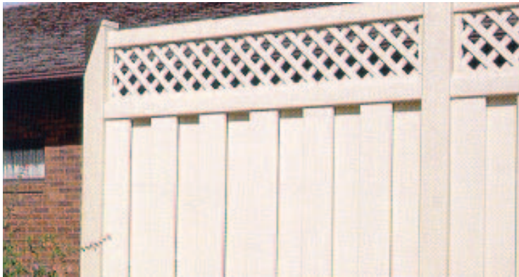
Acceptable privacy fencing - solid opaque to 4'-0" with lattice above