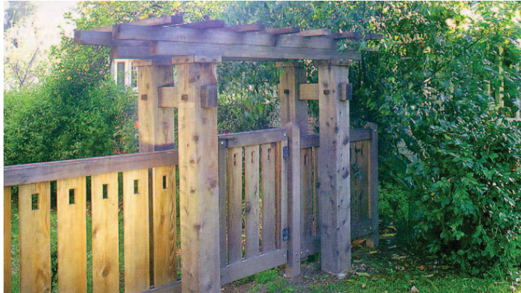
Natural wood fence—acceptable height, color, and design

Required. All fences shall remain their natural color. Painting of the wood is not allowed.