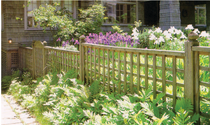
Cedar stepped fence with lattice design

Required. All fences shall be constructed at a distance of at least four (4) feet behind a line extending from the wall plane of the residence closest to the street.