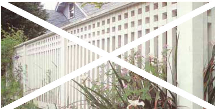
Painted wood fence—NOT ACCEPTABLE