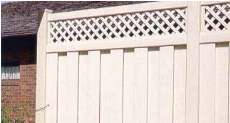
Acceptable privacy fencing - solid opaque to 4'-0" with lattice above