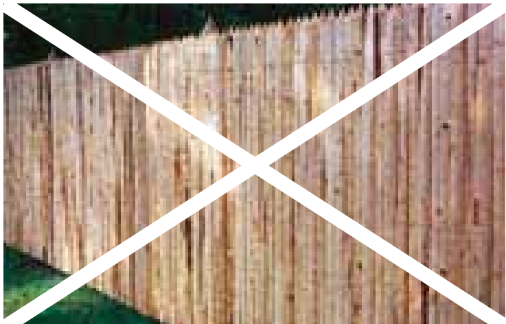
Stockade fencing—NOT ACCEPTABLE