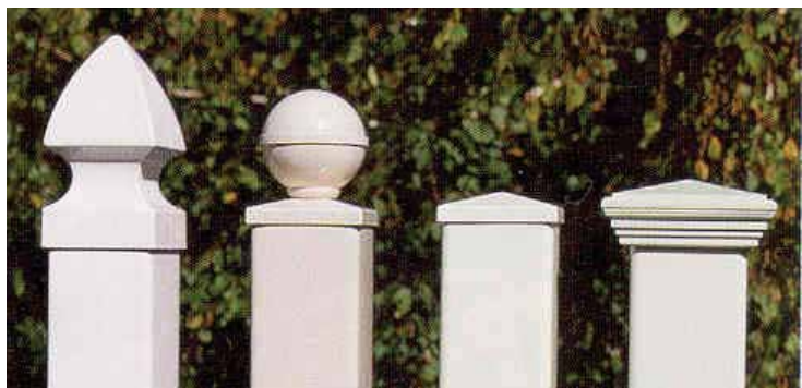
Examples of acceptable cap styles