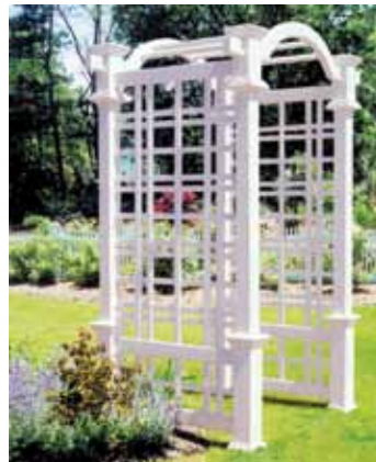
Examples of white vinyl arbors and gates acceptable for NU-Lots.