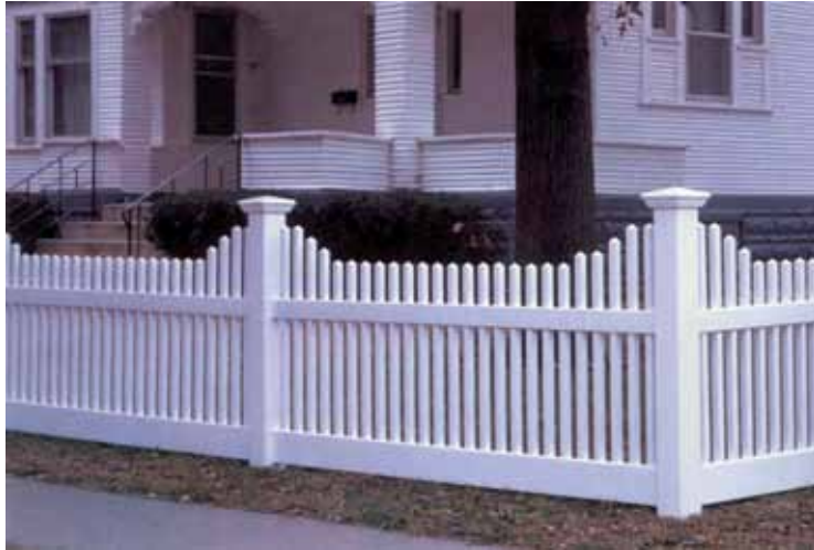
Vinyl fencing is the only acceptable material on NU-Lots

Required. All vinyl fences on the NU-Lots shall be white.