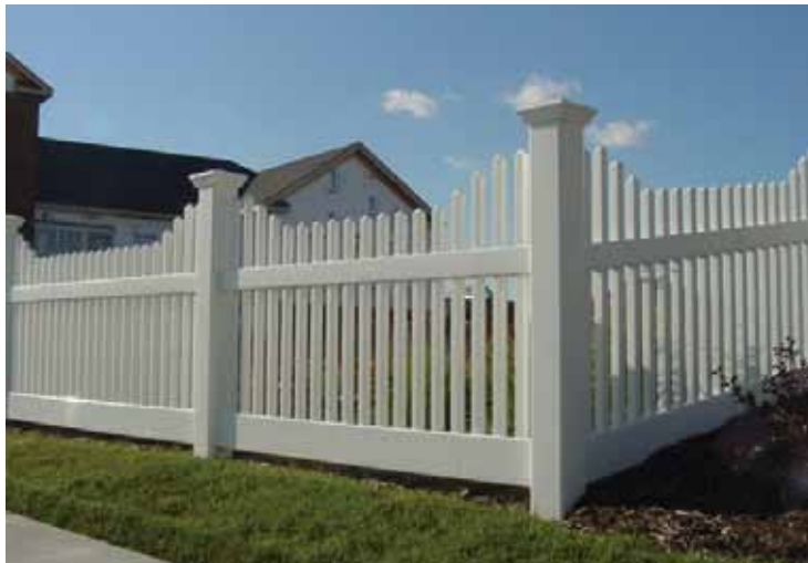
4'-0" vinyl fence with 1-3/8" stepped pickets