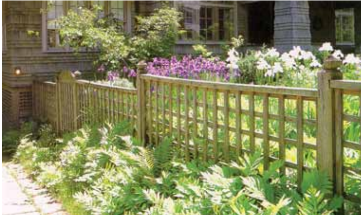
Cedar stepped fence with lattice design

Required. All fences shall be constructed at a distance of at least four (4) feet behind a line extending from the wall plane of the residence closest to the street.