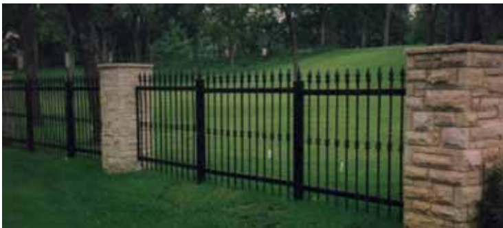
Ornamental iron fence with masonry columns encouraged on P-Lots