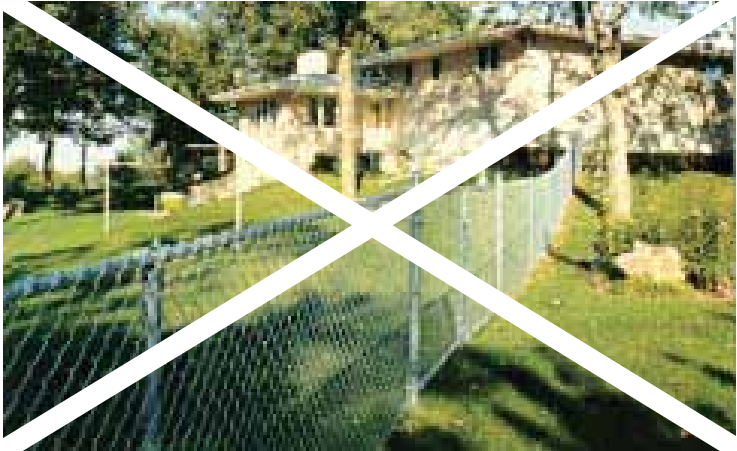
Chain-link fencing—NOT ACCEPTABLE

Stockade and chain-link style fencing are strictly prohibited on S- and P-Lots. Chain-link fence may be used for kennels only and must be either green or black in color.