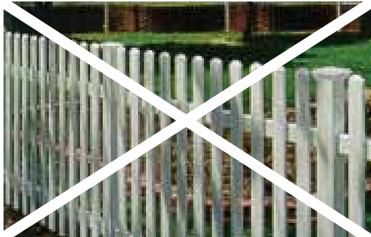
3" wide pickets—NOT ACCEPTABLE