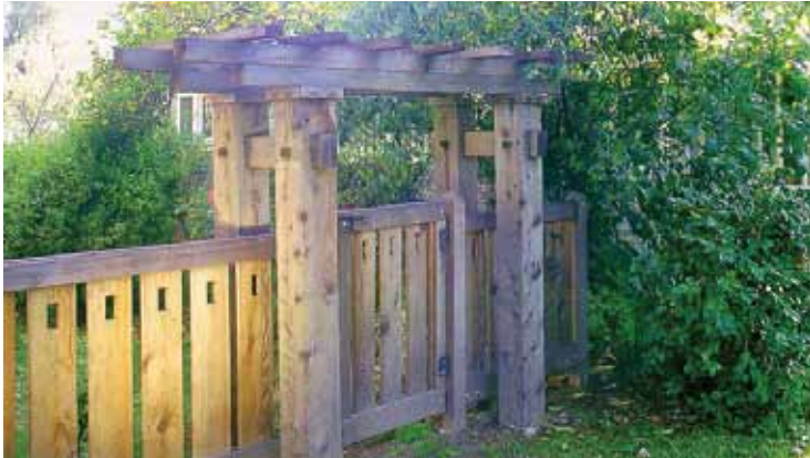
Natural wood fence—acceptable height, color, and design

Required. All fences shall remain their natural color. Painting of the wood is not allowed.