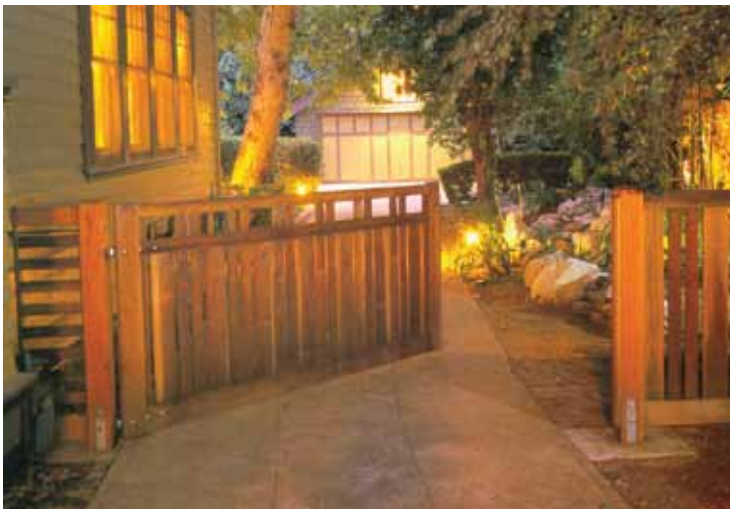
4' side yard wood fence and gate

Three (3) to four (4) foot fences are encouraged.