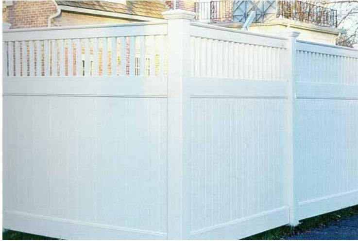
Acceptable privacy fencing - solid opaque to 4'-0" with pickets above