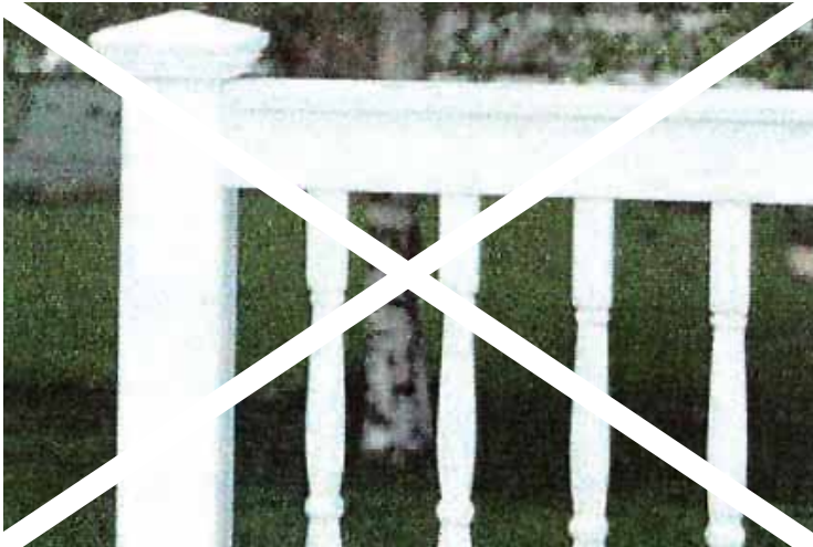
The spindle picket style fence—NOT ACCEPTABLE