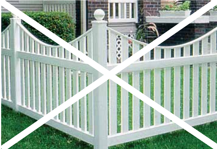
The closed scallop picket style fence—NOT ACCEPTABLE

The gothic, ball, pyramid, and molded decorative cap are allowed on fences occupying a NU-Lot.