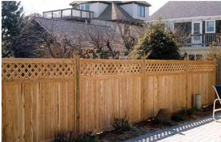
Acceptable solid opaque fence up to 4'-0" high with lattice above.

Required. Fences shall not be fully opaque solid. Fences may be opaque solid up to four (4) feet in combination with picket or lattice designs.